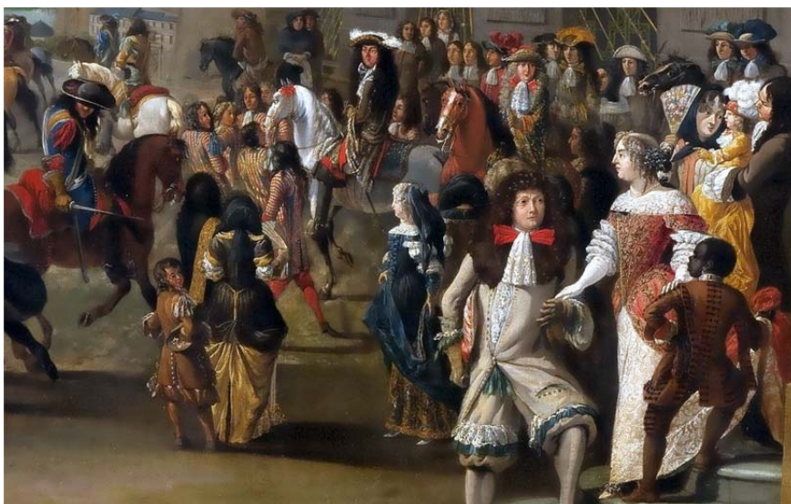
„Louis XIV, à cheval, devant la grotte de Thétys“, c. 1680, anonymous painter.

Organization Pascal FIRGES (DHIP) Regine MARITZ (Universität Bern)